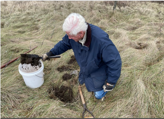
Taking soil samples for analysis*